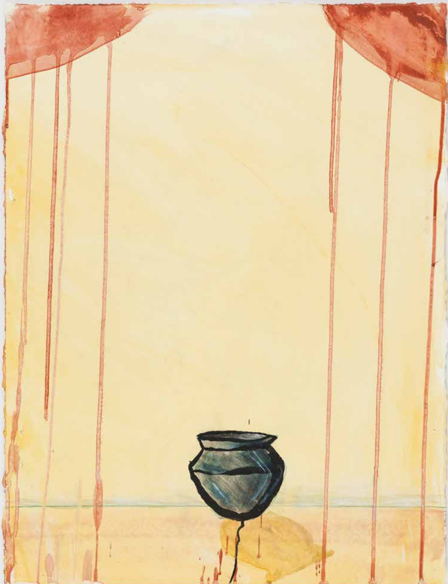
Untitled (vessels) , c. 1990-1

To me, all of this work is about fragility. Bodies are fragile, drawings are fragile, memories are fragile, love is fragile, even cities are fragile. Bugs, leaves, and Cheez Doodles are fragile. If monuments or memorials are meant to counteract fragility, Jernigan chose to preserve it, even caress it, with a couple of pencils and some paper.