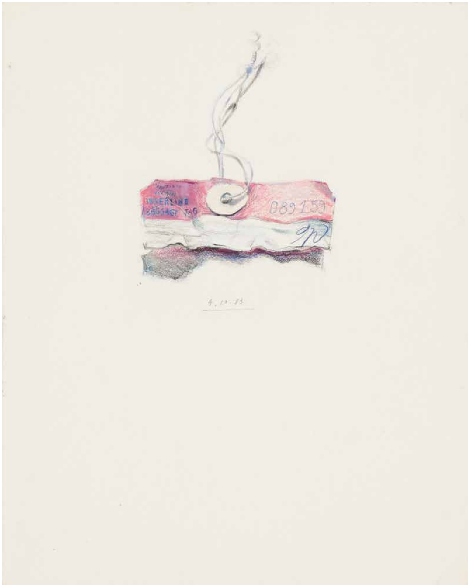
Untitled (Still Life) 4.10.83 (Luggage tag), 1983

Evidence can come in all shapes and sizes, but Jernigan preferred the type she could pick up and put in her bag (and then, sometimes, in her freezer, a few inches away from dinner). She wasn't interested in unique or precious "rare finds." Instead, she was after the surplus, all that which is also already available in every corner store or on every other sidewalk.