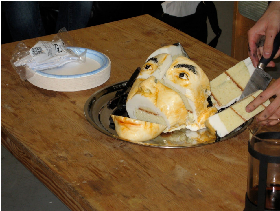
Heads of the Department, 2006