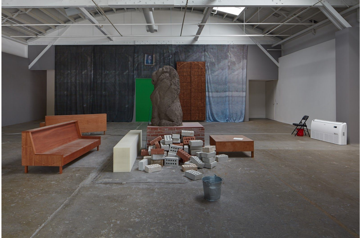
cast for a folly, Wattis Institute for Contemporary Art, 2019