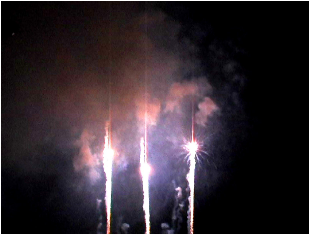
August 2006, 2006