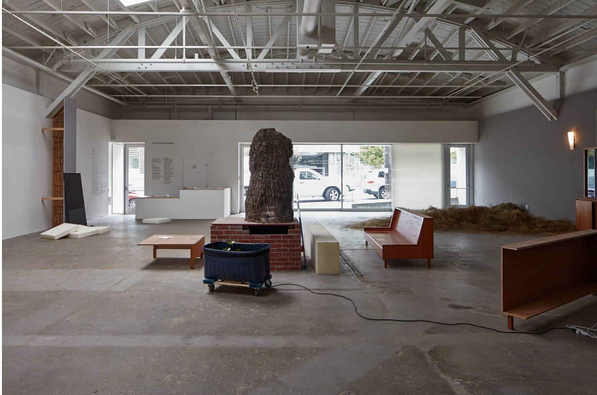
cast for a folly, Wattis Institute for Contemporary Art, 2019