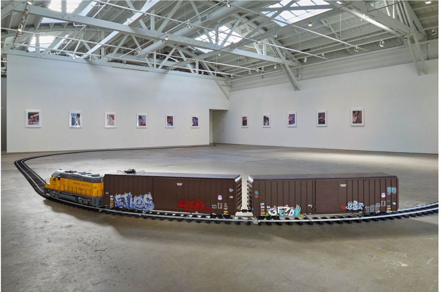
Josephine Pryde, Lapses In Thinking By The Person I Am, installation view at the CCA Wattis Institute for Contemporary Arts, May 5 – August 1, 2015.

but also disconcertion for placing the work together with the train in some kind of logical context; by using the story of her body and objects that she interacts with, Pryde literally derails the misconceived notion that we are what we own.