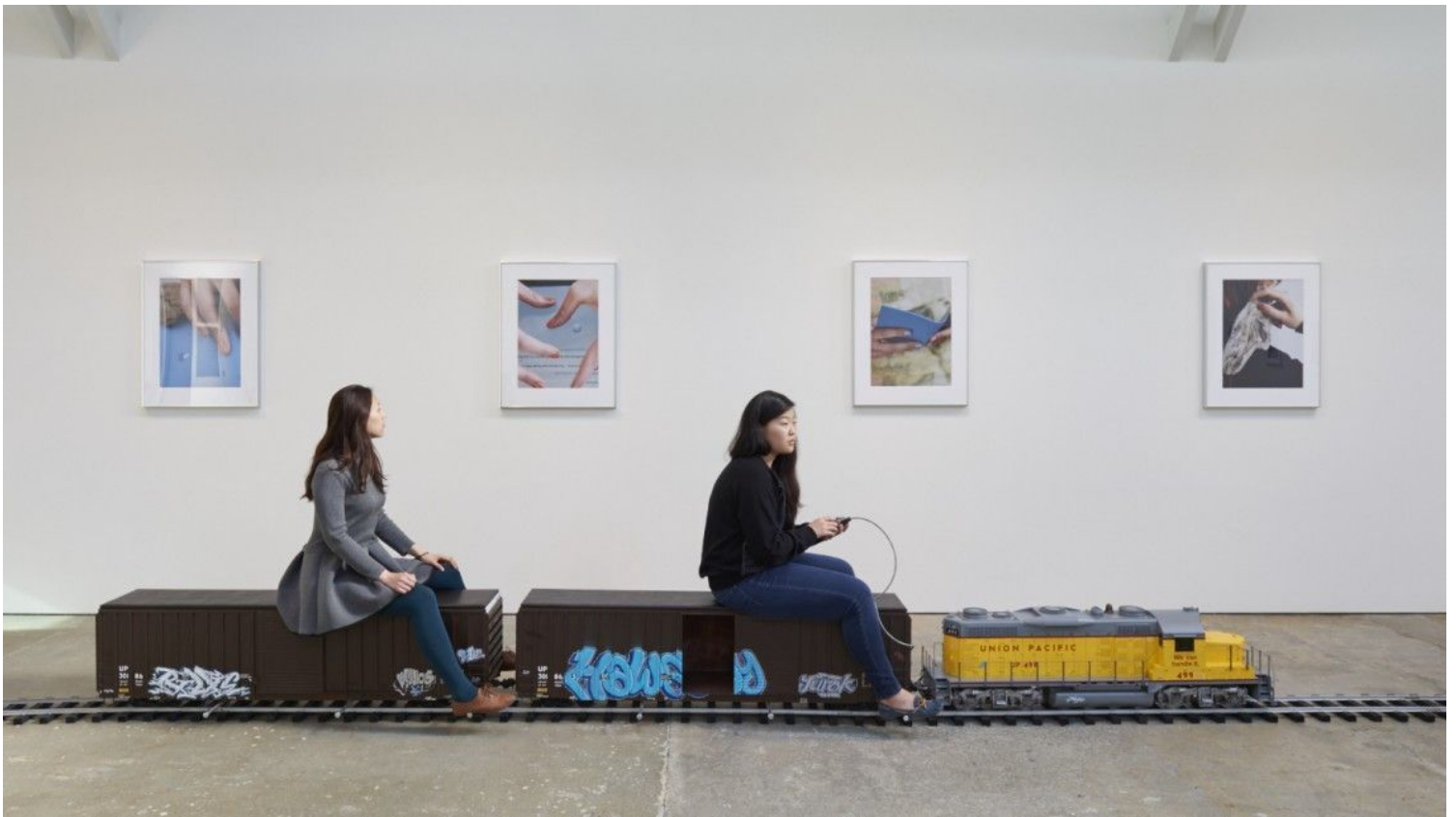
📷 Josephine Pryde, Lapses In Thinking By The Person I Am , installation view at the CCA Wattis Institute for Contemporary Arts, May 5 - August 1, 2015.